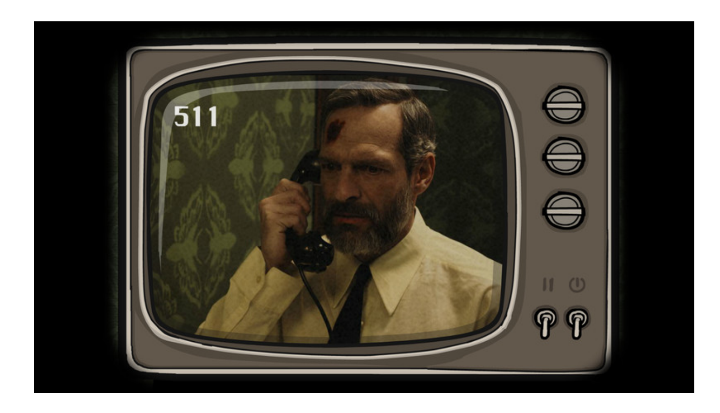
Cube Escape: Paradox Torrent Download [hacked]